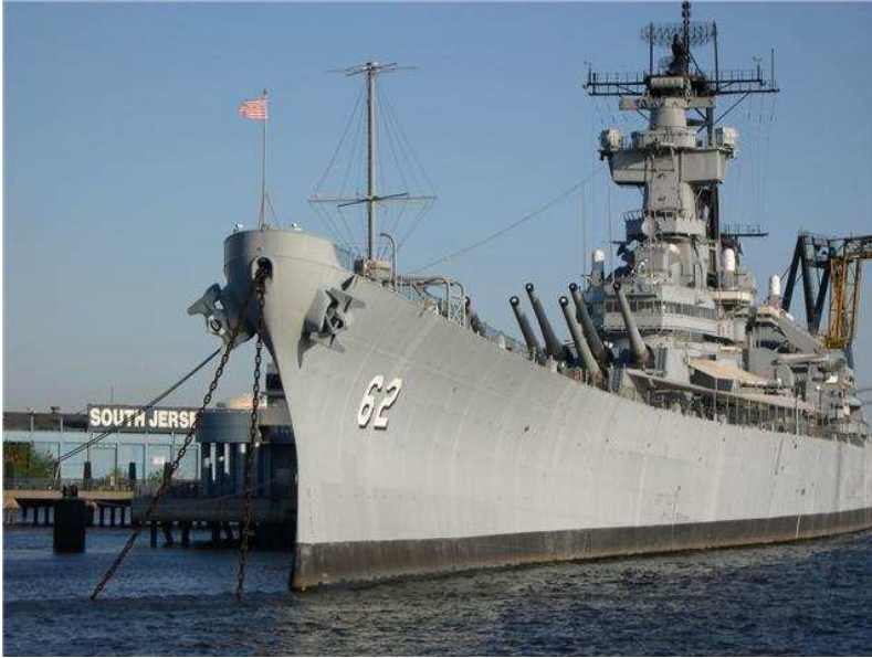
The Battleship New Jersey docked along the New Jersey side of the Delaware