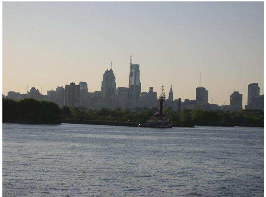
Spectacular view of the Philadelphia skyline