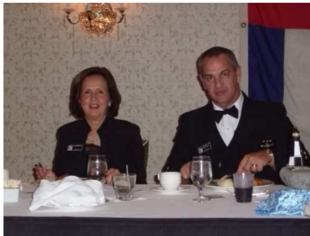
Our own first couple enjoy their dinner Saturday night at the banquet during Fall Conference.