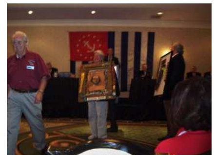
Even Sourpuss made an appearance at Fall Conference