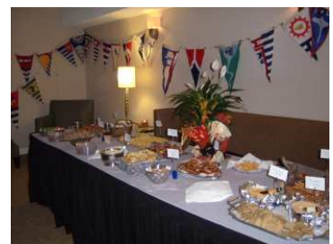
Part of the delicious spread put out for the cocktail party