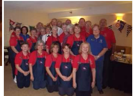
The District Aides gather before the District Commander's Cocktail Party